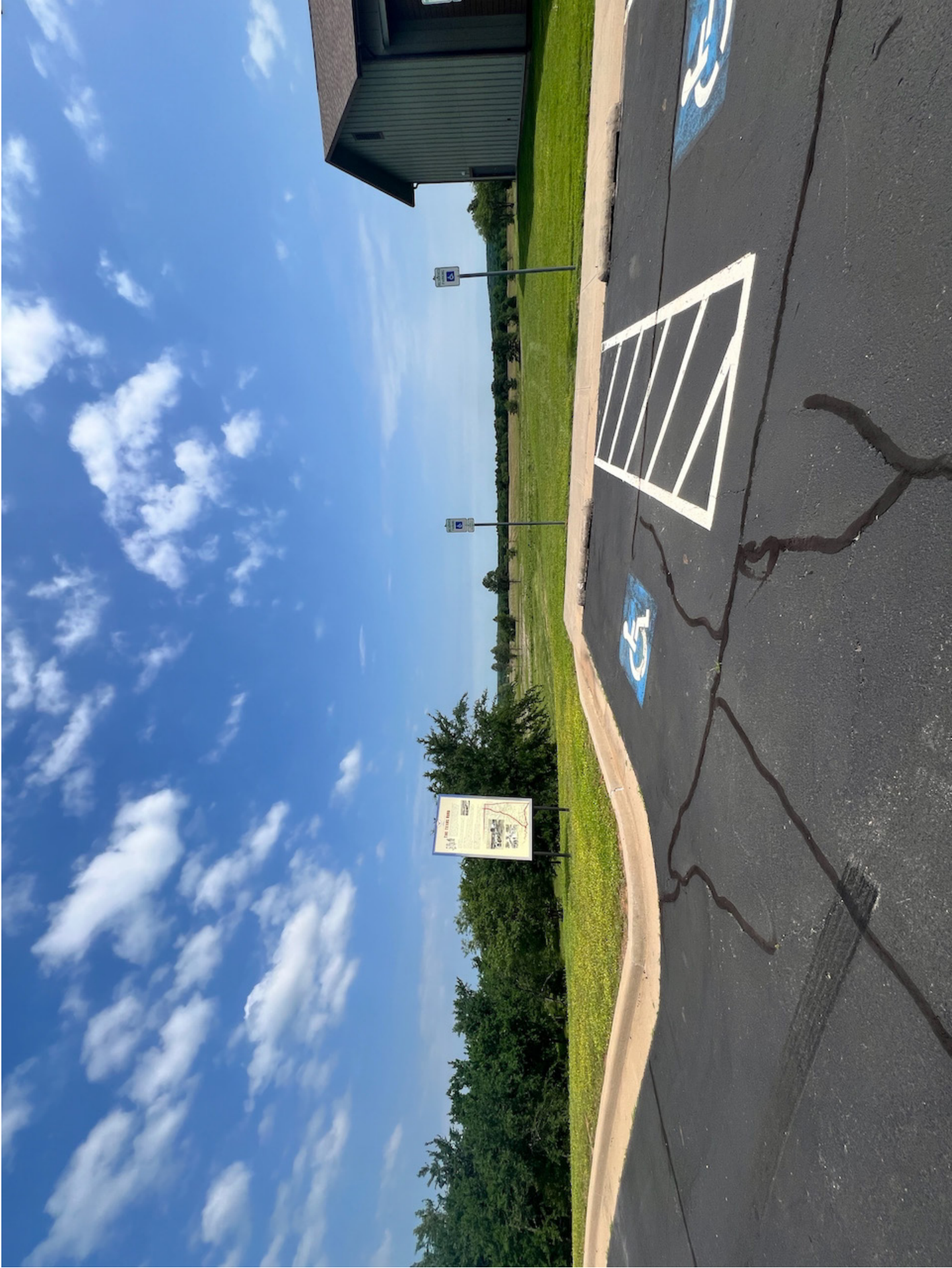
NOTE: The existing signage will be removed