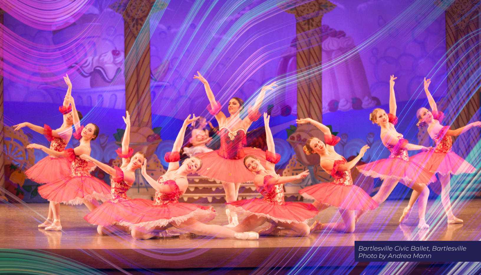
Bartlesville Civic Ballet, Bartlesville