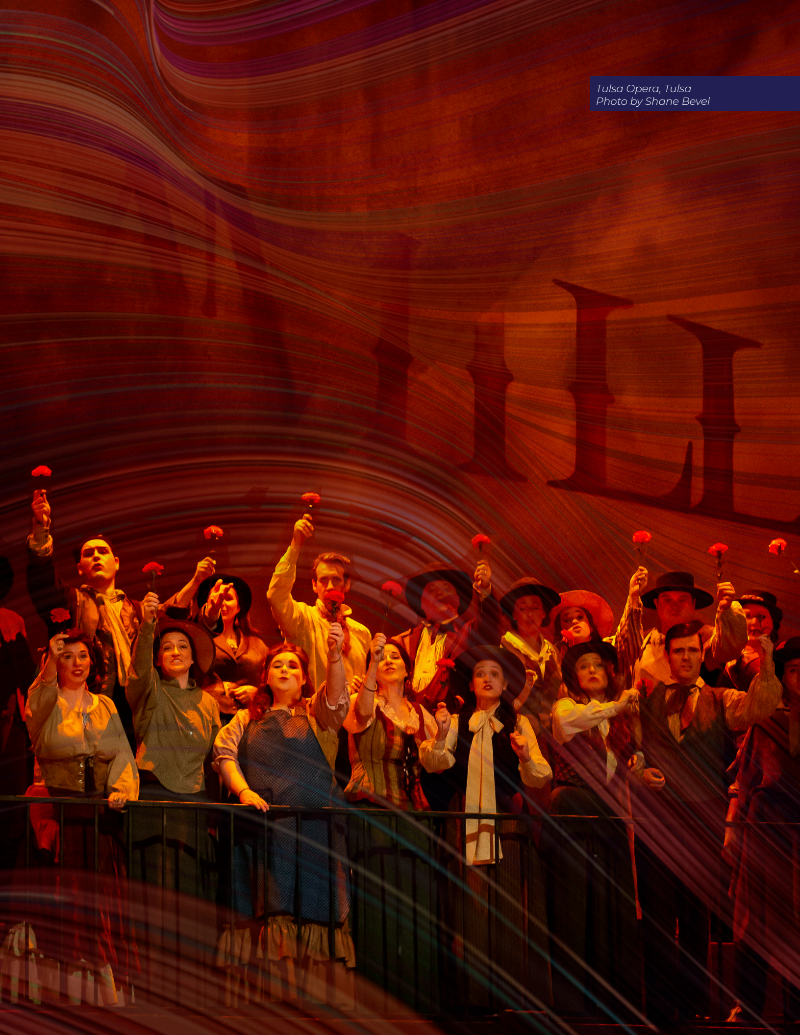
Tulsa Opera, Tulsa