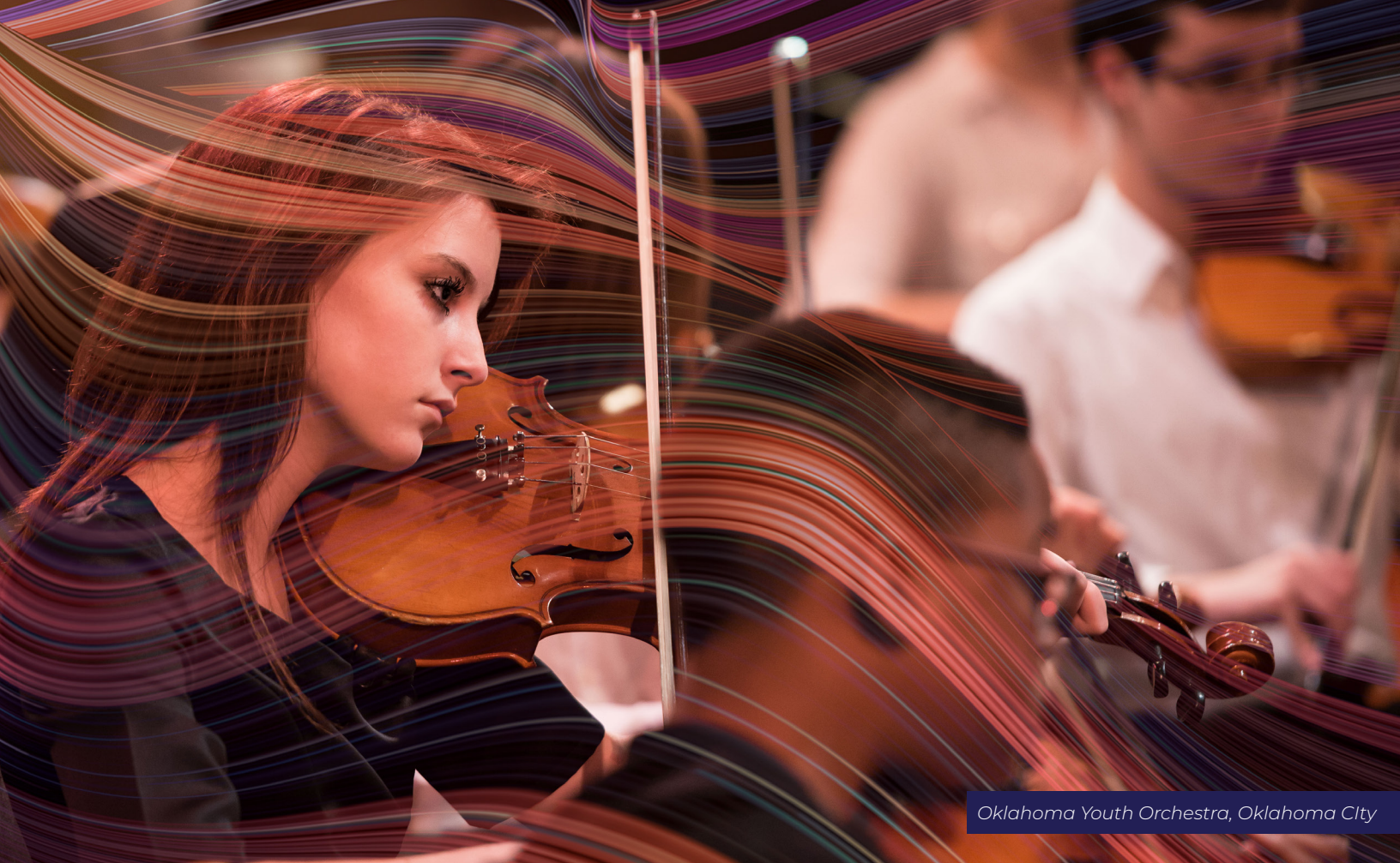
Oklahoma Youth Orchestra, Oklahoma City