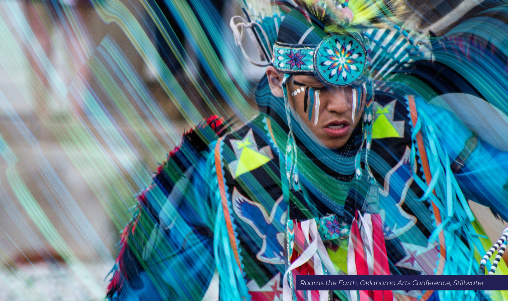
Roams the Earth, Oklahoma Arts Conference, Stillwater